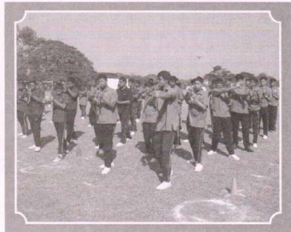
Lezim Show on Sports Day