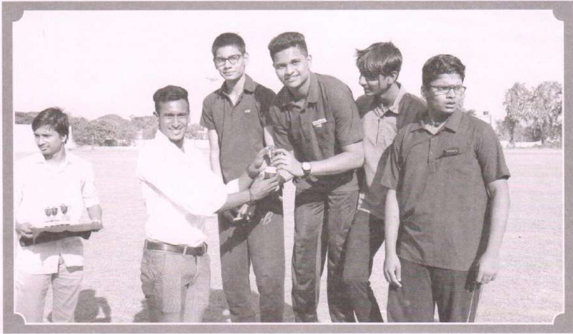
Fastest Runners Receiving Award